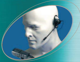
■ EA19/750 ▲ EA19/950