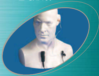
■ EA15/750 ▲ EA15/950