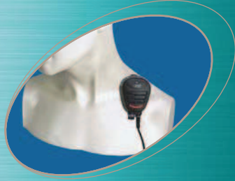
■ CMP750 ▲ CMP950