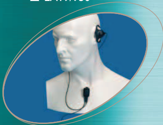
■ EA12/750 ▲ EA12/950