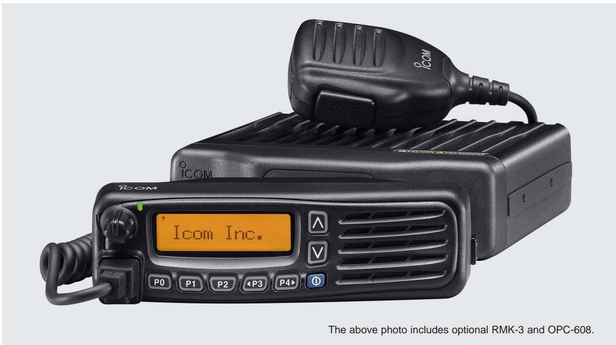
The above photo includes optional RMK-3 and OPC-608.

Icom proudly announces the debut of the new mobile transceiver, IC-F5060/F6060 series. This series is designed as a complementary model to the handheld IC-F3060 series, and has many attractive features that are suited to the local government, public safety, utility companies and B&I markets. Features such as full-dot matrix LCD, detachable front panel, multiple signalings, trunking mode and voice scrambler, and it is the first Icom mobile radio compatible with the 6.25kHz digital mode.