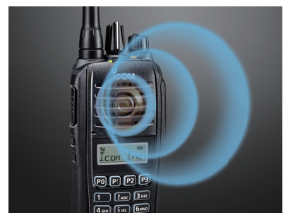
1500 mW powerful audio