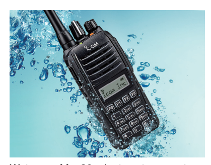
Waterproof for 30 minutes at one meter