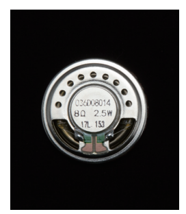
Icom custom high power handling capacity speaker